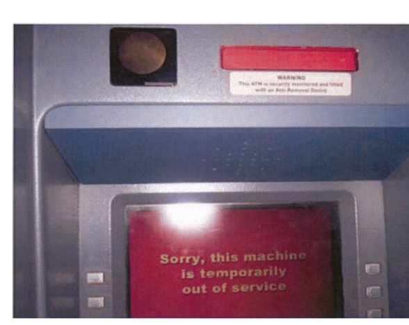
What appears to be a normal speaker above the keypad is actually a hidden camera to read your pin number