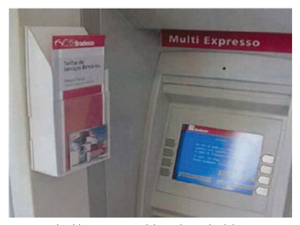
Looks like a normal brochure holder notice how thick the holder is - this is to allow the video camera to hide inside