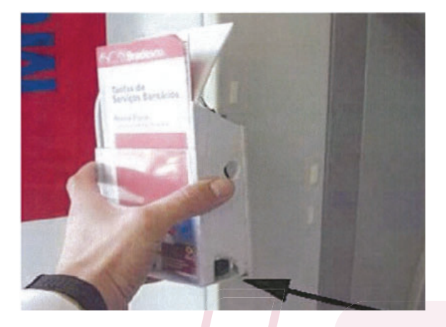
On the interior side of the holder, a hole is cut out to allow the video camera to view your pin number and account number