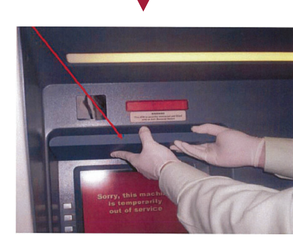
Removal of the fake device from the ATM machine.