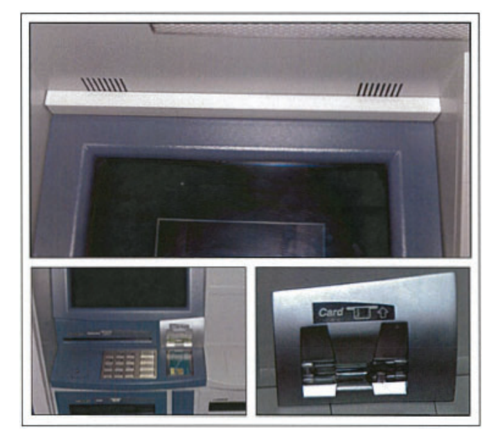
Skimming typically involves the use of hidden cameras (top) to record customers' PINs and phony keypads (right) placed over real keypads to record keystrokes.

Their scheme involved installing surreptitious surveillance equipment on New York City ATMs that allowed them to record customers' account information and PINs, create their own bank cards, and steal from customer accounts.